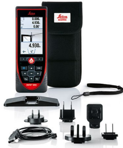
Leica DISTO™ S910 Art. No. 805080 Art. No. 808183 for U.S.

Leica DISTO™ S910, pouch, adapter for corner measurement, set-up plate for Smart Base, hand loop, USB charger, Calibration Certificate Silver, quick start guide