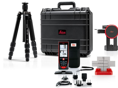
Leica DISTO™ S910 P2P package Art. No. 887900

Leica DISTO™ S910, pouch, adapter for corner measurement, set-up plate for Smart Base, hand loop, USB charger, Calibration Certificate Silver, quick start guide